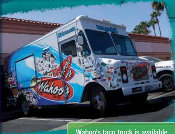
Wahoo's taco truck is available for catering at an extra charge.

BIG OR SMALL... Wahoo's unique flavors and tastes are here for you.